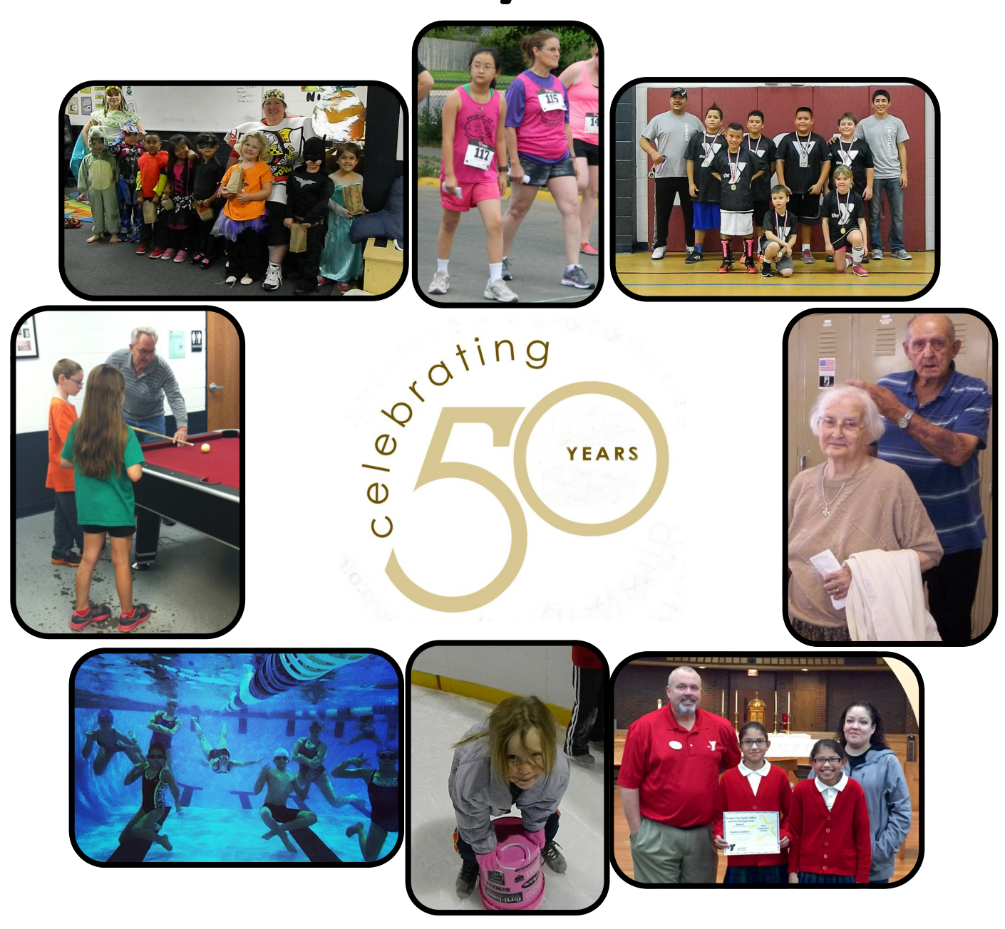
Monumental Moments ... 6th Edition GARDEN CITY FAMILY YMCA 2014